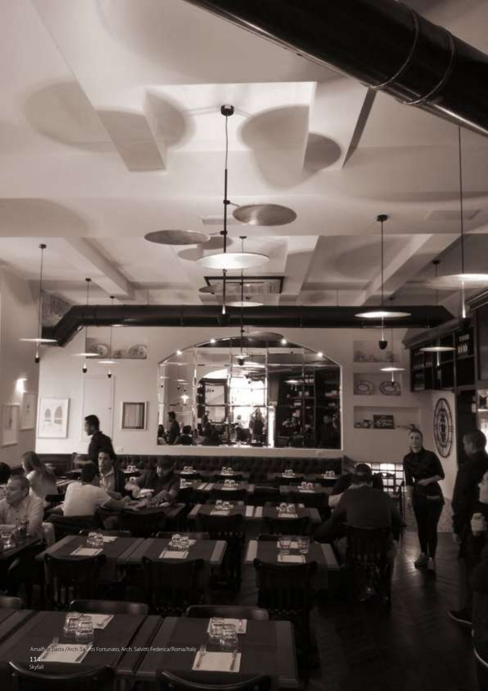
Amalfi in pasta / Arch. Salvitti Fortunato, Arch. Salvitti Federica/Roma/Italy 114 Skyfall