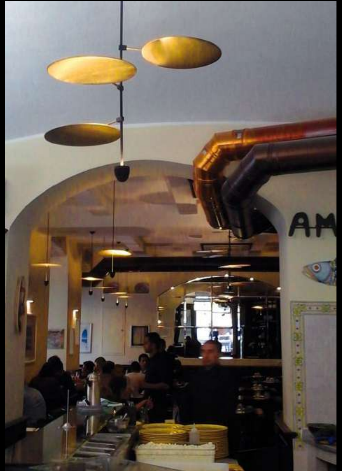
Amalfi in pasta / Arch. Salvitti Fortunato, Arch. Salvitti Federica/Roma/Italy 115 Skyfall